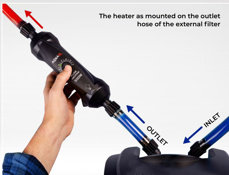
The heater as mounted on the outlet hose of the external filter