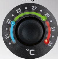
Working temperature range

The heater operates within a range of 20°C to 33°C.