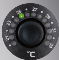
Constant temperature mode

A constantly lit, single LED indicates that the programmed temperature is being maintained.